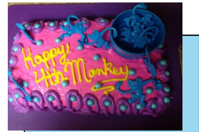
Zary's birthday cake!